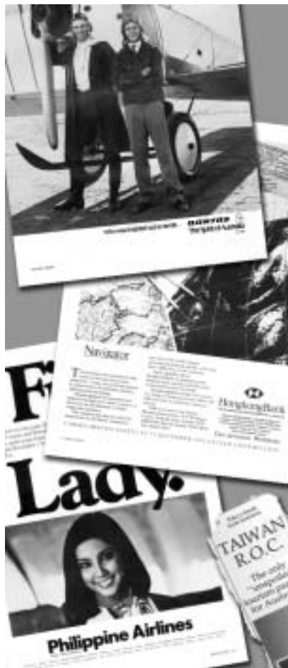
Another era: advertising from our first issue — Qantas, HSBC, Philippines Airlines — and part of that offending placement from Taiwan.

To our subscribers, advertisers and others who have believed in us, and supported us in so many ways over 20 years — thank you. We affirm our commitment to excellence in reporting of regional business.