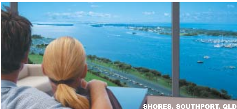
SHORES, SOUTHPORT, QLD