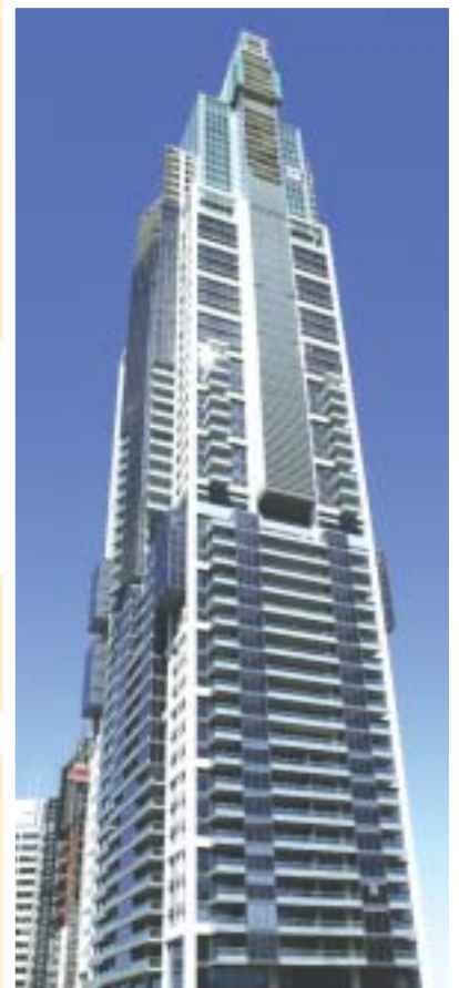
WORLD TOWER, SYDNEY CBD

Meriton have also pioneered a fantastic new location on Queensland's Gold Coast. Brighton on Broadwater, the first stage of which, Shores, is due to be released before Christmas this year.