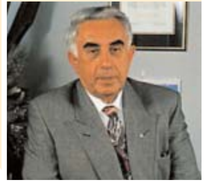
HARRY TRIGUBOFF AO PROPERTY MAN OF THE YEAR 2003