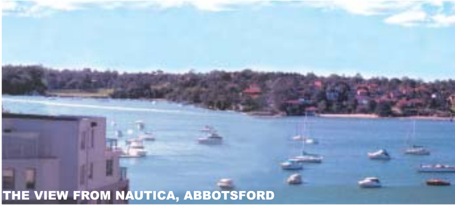
THE VIEW FROM NAUTICA, ABBOTSFORD